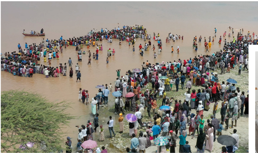
A mass baptism took place in Ethiopia at the end of the series.

Mission dentists saw thousands of patients during the trip.